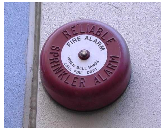
Audible sounds via a bell or siren