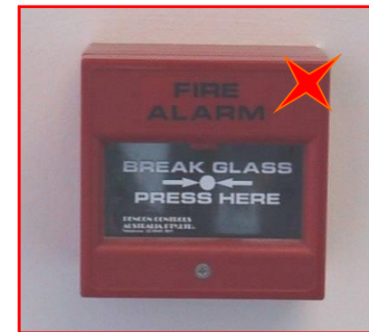
Manual Call Point