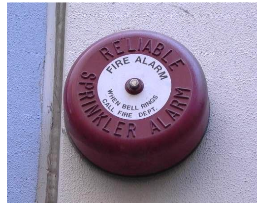
Audible sounds via a bell or siren