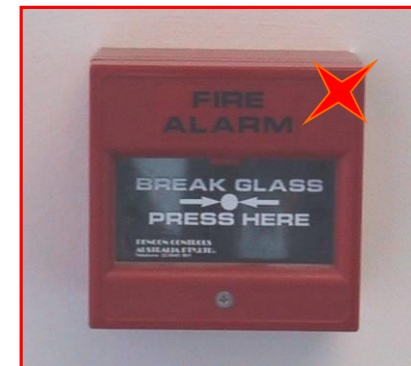
Manual Call Point