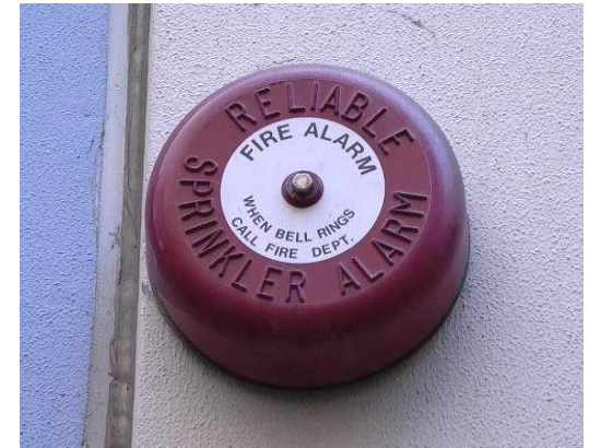
Audible sounds via a bell or siren