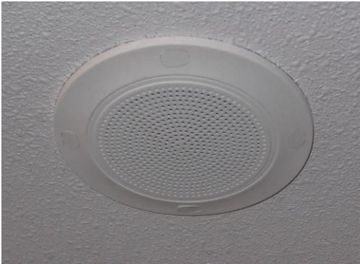
Audible sounds via the PA system

You could be alerted to the fire detection systems activation by auditory and/or visual means